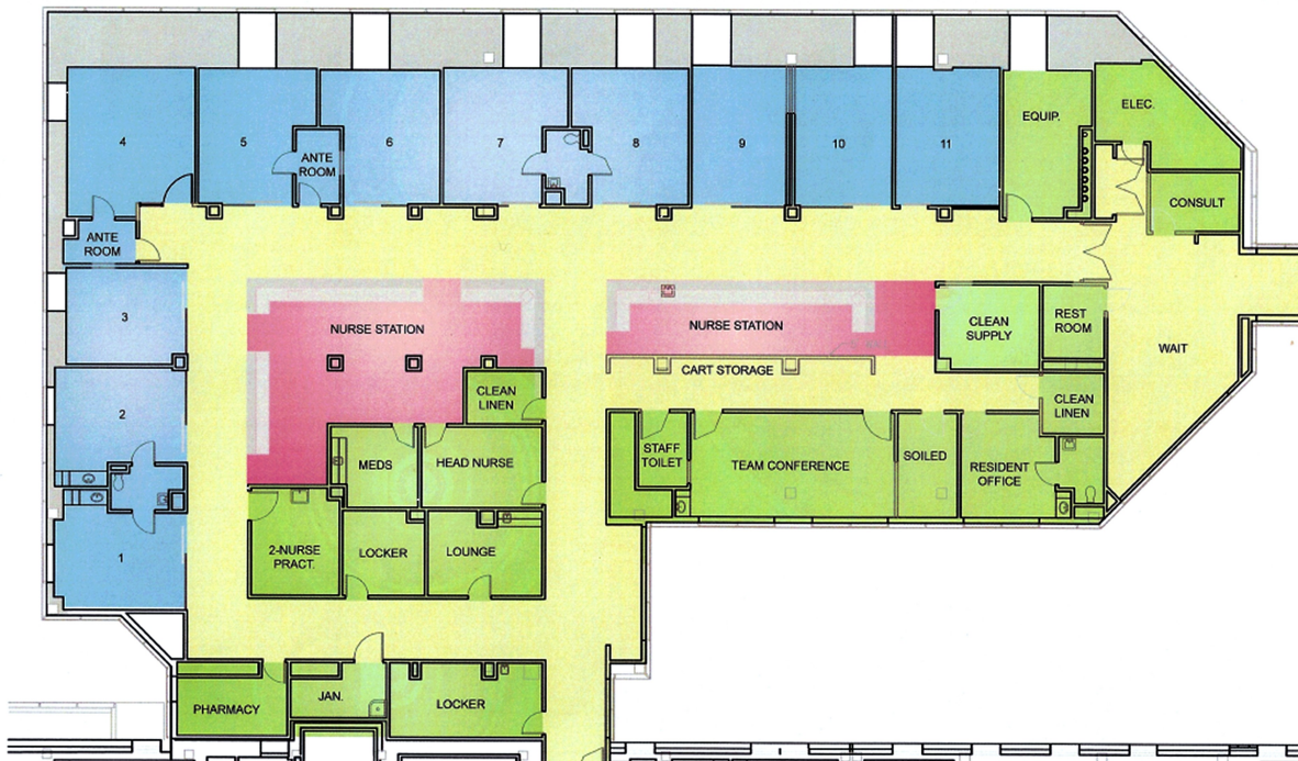
SURGICAL INTENSIVE CARE UNIT