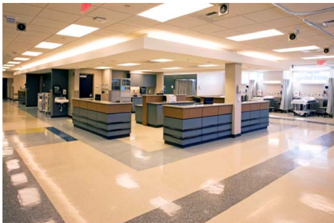
Architect: Birchfield Penuel & Associates